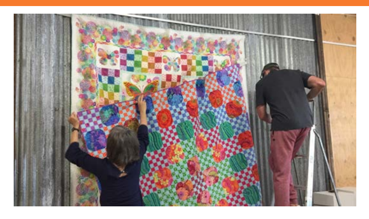
Volunteers setting up for the quilters exhibition

Survey the vista of the current exhibition at the Foundry and it is evident that the members of Rich River Quilters and friends have not been idle during lockdown.