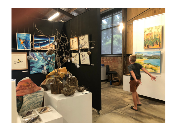
Many multi-generational families enjoyed the whole exhibition.