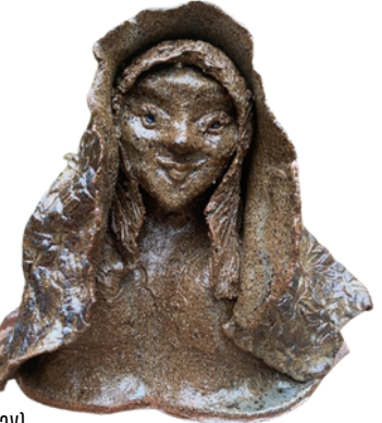
Barb Magnay "Elfin Lady" (raku clay)