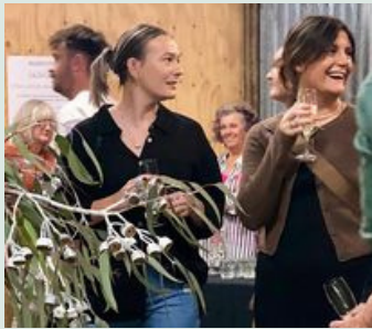
visitors enjoying the art