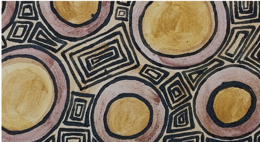
Eric Brown From the earth (detail) natural pigment

saturday july 15th, 2pm until - august 12th 2023